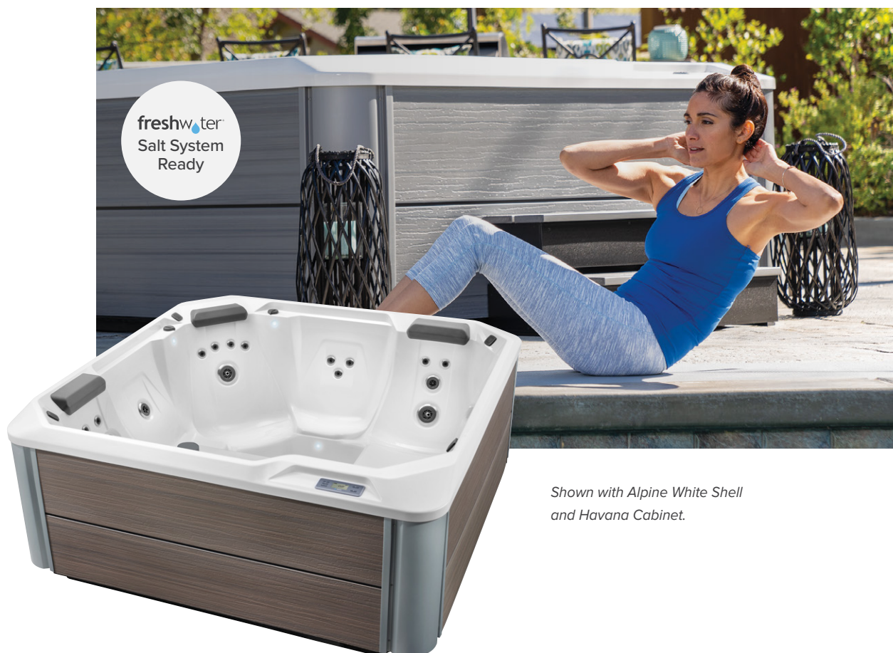
Shown with Alpine White Shell and Havana Cabinet.