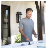
FreshWater® Salt System Ready